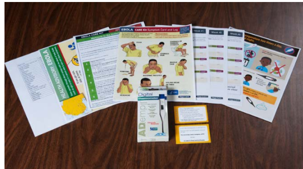
Traveler CARE Kit

http://www.cdc.gov/media/releases/2014/p1022-post-arrival-monitoring.html